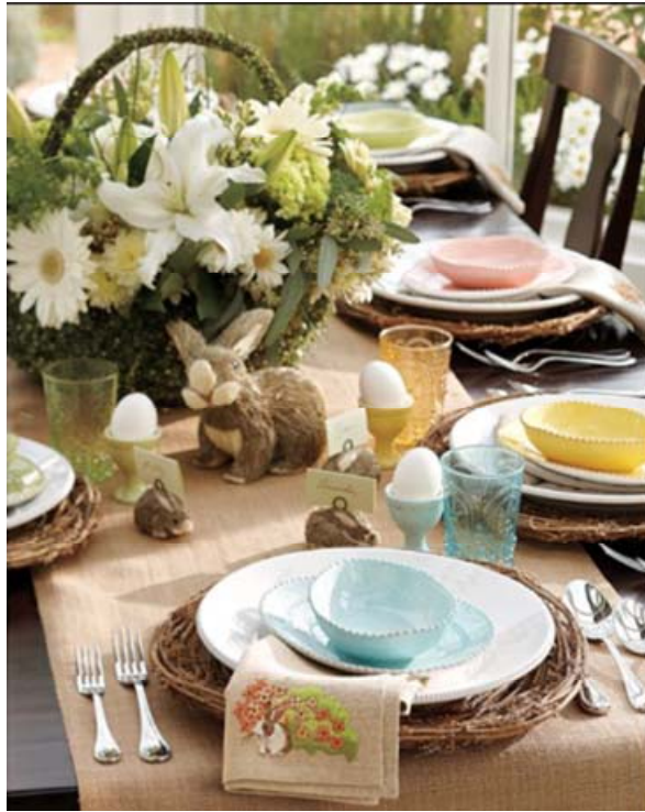
TABLE SETTING LUNCHEON - 2013

Mark your calendar for Tuesday, March 5 for this annual MYC event!